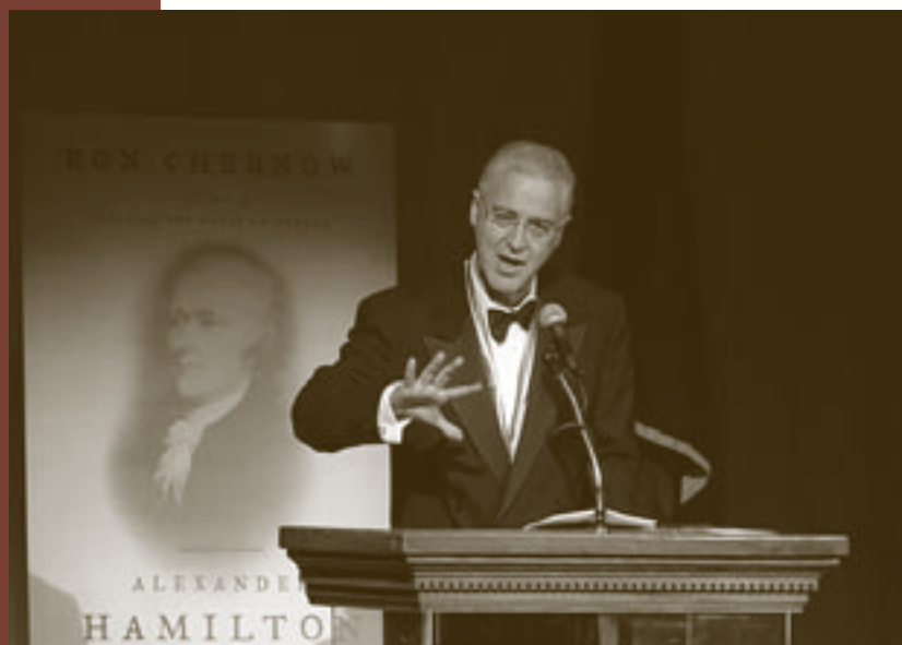
Ron Chernow, pictured here accepting the George Washington Book Prize at Mount Vernon, will visit campus September 15.