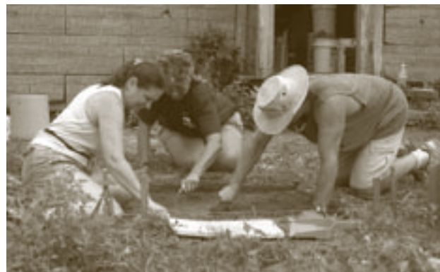
Local history teachers get their hands dirty at the Sumner Post.

Lectures, slide presentations and work with documents and artifacts took place at the Custom House. At the Sumner Post, participants worked alongside staff and students of Washington College's 2005 Summer Field